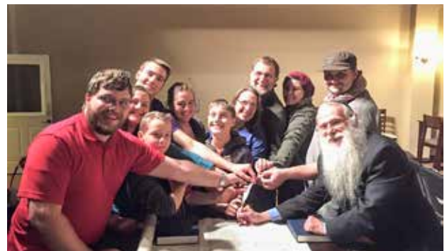
The Signing of the Scroll Project 613

Did you know that writing a new Torah is the 613th commandment? Stop by the Project 613 booth at the Jewish Food & Cultural Festival on Sunday, April 10, anytime from 9 a.m. to 4 p.m. to complete this rare mitzvah and support Project 613, a fundraiser to support programming at Congregation Etz Chaim in Bentonville. For a minimum $50 donation, you can dedicate a part of our new Torah and write in the actual scroll with a sofer (scribe) right at the festival. There will also be foods from the Bible available to purchase. The festival is being held at War Memorial Stadium in Little Rock. For more information, contact cecproject613@gmail.com .